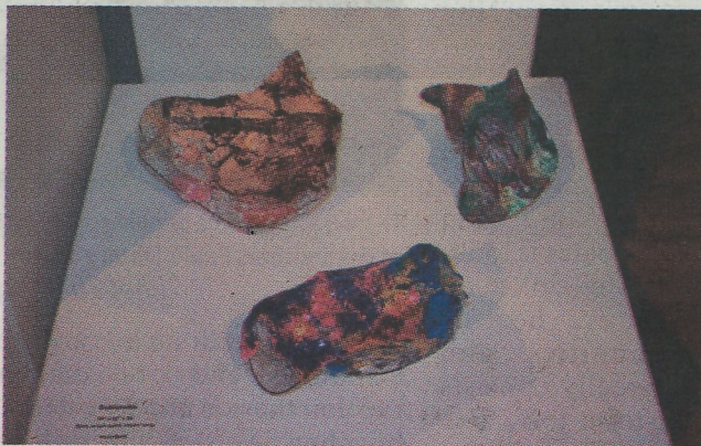
Some of Rath's works include attempts to be less wasteful with a variety of substances. Those attempts are surprisingly engaging.